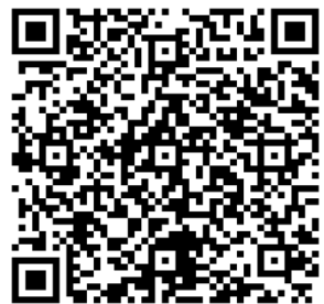
Scan the QR Code for the SPB online giving portal

Mass Intentions At each Holy Mass, we hear Father audibly say a person’s name during the Eucharistic Prayer, this is called the “Mass intention.” This means that this Holy Mass is being offered for the particular intention (for the repose of the soul of someone who had died, or for a special intention of someone who is still living but in need of prayers). If you would like a Holy Mass to be offered for such intentions, please call or email the parish office to schedule it. Remember, the greatest thing that we can do for someone is to pray for them, and the Holy Mass is the greatest grace of all prayers.