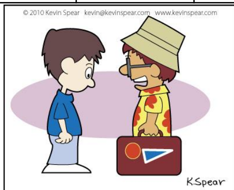
"Thanks for inviting me to vacation Bible school. I'm all packed."