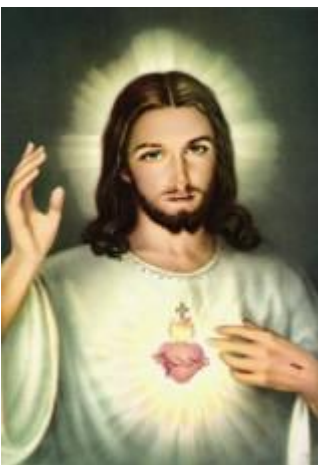
Feast of The Most Sacred Heart of Jesus Feast Day June 7

MAY THE MOST HOLY, MOST SACRED, MOST ADORABLE, MOST INCOMPREHENSIBLE AND UNUTTERABLE NAME OF GOD BE ALWAYS PRAISED, BLESSED, LOVED, ADORED AND GLORIFIED, IN HEAVEN, ON EARTH AND UNDER THE EARTH, BY ALL THE CREATURES OF GOD, AND BY THE SACRED HEART OF OUR LORD JESUS CHRIST, IN THE MOST HOLY SACRAMENT OF THE ALTAR. AMEN.