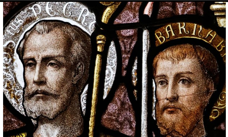
Image: Stained glass window of Saints Peter and Barnabas in the cathedral of Saint Corentin

When Paul stood up to Peter for not eating with gentiles for fear of his Jewish friends, we learn that "even Barnabas was carried away by their hypocrisy" (see Galatians 2:1-13).