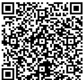
Scan the QR Code for the SPB online giving portal

Thank you for your generosity in supporting the parish! May you and your loved ones receive blessings in return.